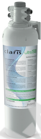
Head sold separately.

Claris Ultra 1500-XL Filter Cartridge: EV4339-83